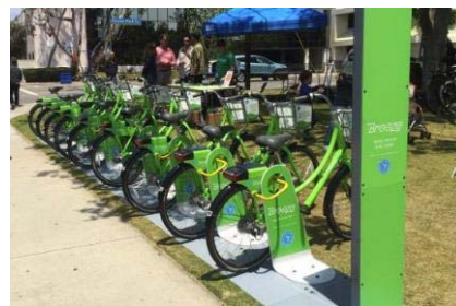
Bikeshare systems in Washington DC, and Santa Monica, CA (clockwise from above)